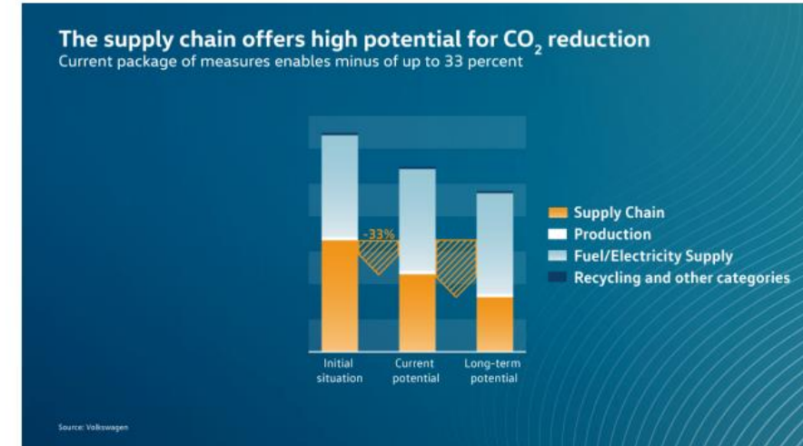
A lot of CO 2 can be saved in the extraction of raw materials and the upstream production of materials and components.